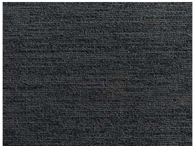
004 - Anthracite