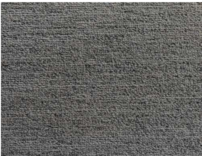
003 - Hemming