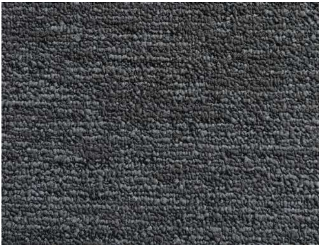
001 - Overcast